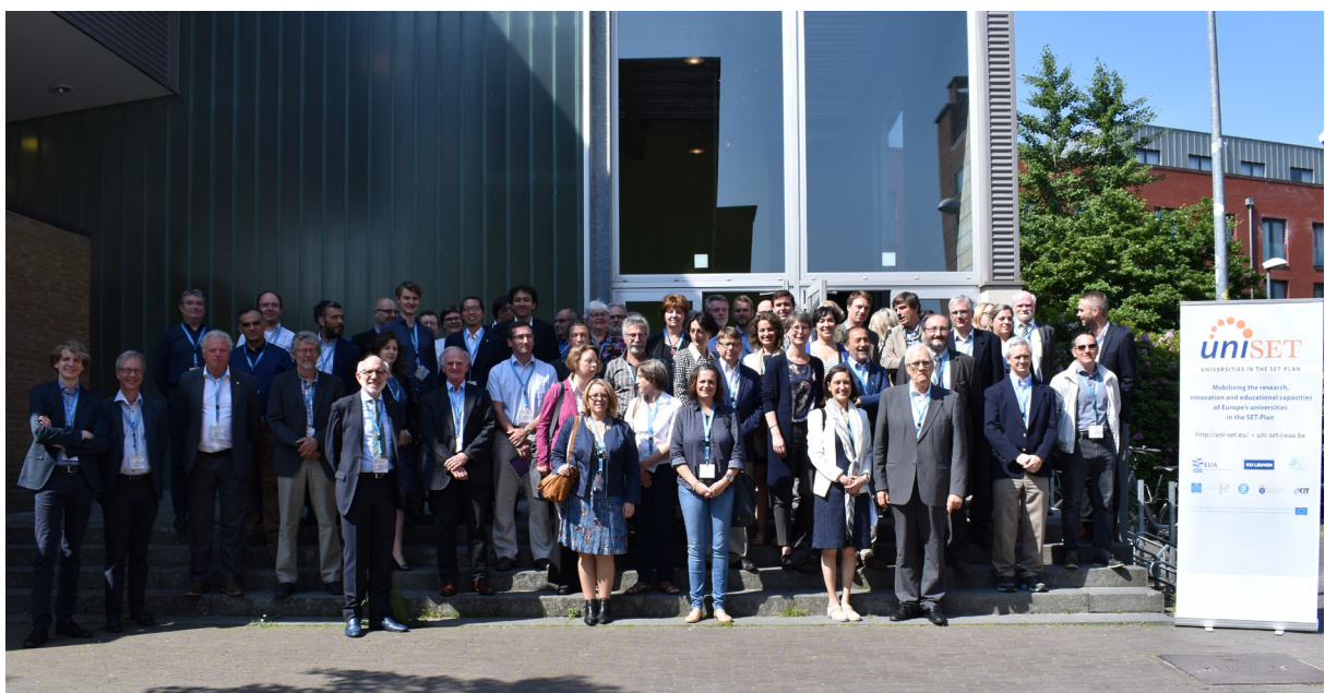
5th UNI-SET Energy Clustering Event