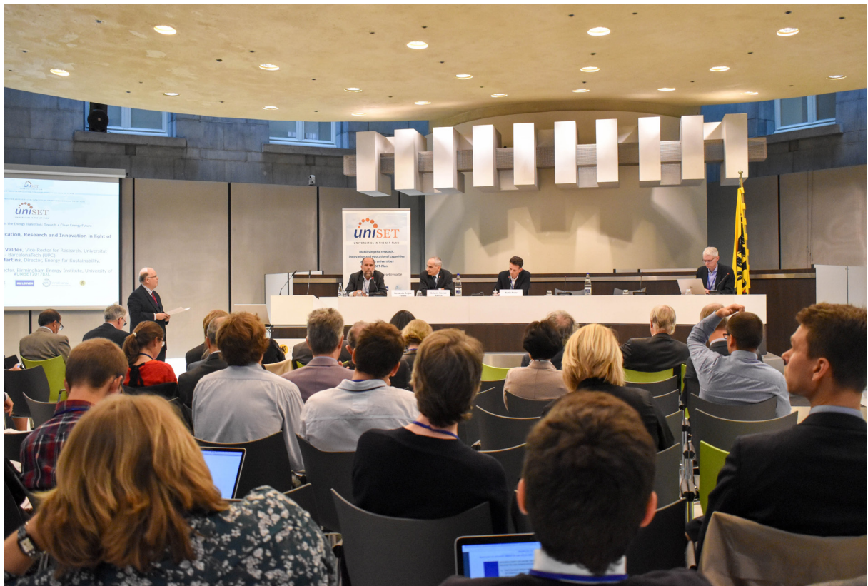
6 th UNI-SET Energy Clustering Event