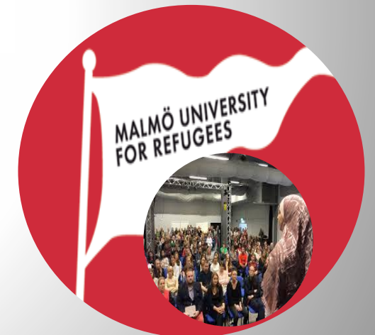
GLOBAL ENGAGEMENT SUSTAINABLE LEARNING