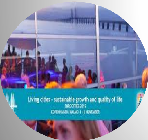
CO-CREATION OF KNOWLEDGE