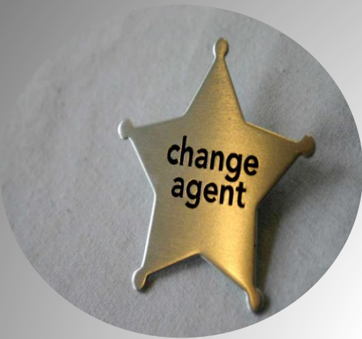
STUDENTS AS CHANGE AGENTS