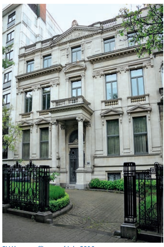
EUA's new office as of July 2010

Offering a coherent programme of events and other services to support all member institutions. Such events and activities seek to develop universities' knowledge and expertise through projects that involve and benefit institutions and inform policy making at all levels. They also strengthen the leadership, governance and management capacities of universities through mutual learning and exchange.