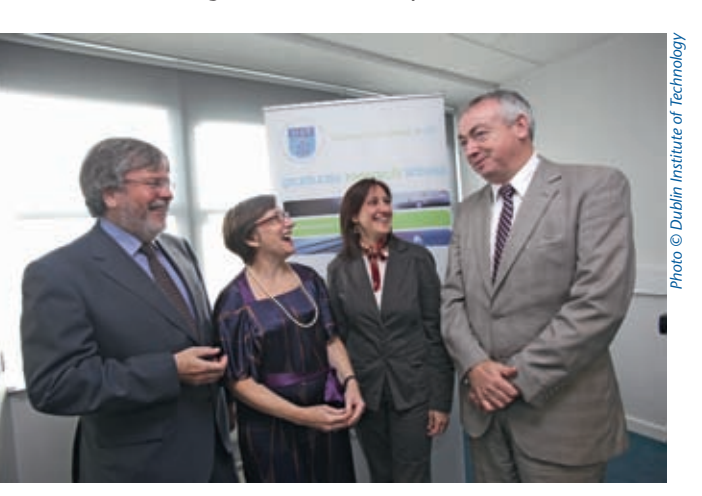
DOC-CAREERS II Workshop, Dublin, Ireland

project aims to contribute to enhanced employability of doctorate holders in the public and private sectors. The project will further explore one of the key findings of the first DOC-CAREERS project i.e. that collaborative doctoral education schemes are very diverse and take account of local and regional cultural differences. The project will examine how universities work with their regional partners (local SMEs, large R&D enterprises, RTD performers, NGOs and other industries). A series of regional workshops will be held to bring together interested partners.