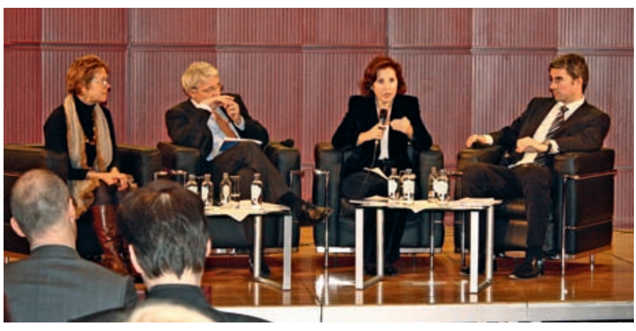
Launch of Financially Sustainable Universities II Report, Brussels, Belgium

This project aims at mapping the status of income diversification in European universities and seeks to provide useful examples of best practice. It will promote the institutional perspective on the topic of funding, with a view to informing national and European policymakers of how best to facilitate a sensible diversification of income streams. It has offered a unique opportunity, in these uncertain times of economic downturn, to ensure that the universities' voice is heard. The final report to be published at the beginning of 2011 gives a detailed description of how European universities are currently financed, and look into the sector's expectations for future evolutions. It also analyses the many different barriers currently preventing universities from pursuing additional income streams (considering internal challenges external regulatory barriers) and the possible drivers for stimulating 'income diversification'.