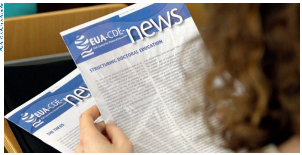
EUA-CDE publishes a quarterly newsletter on key issues relating to doctoral education

independent membership service already has more than more than 190 members, which together create a dynamic platform for leaders of doctoral schools to discuss, develop and implement good practice.