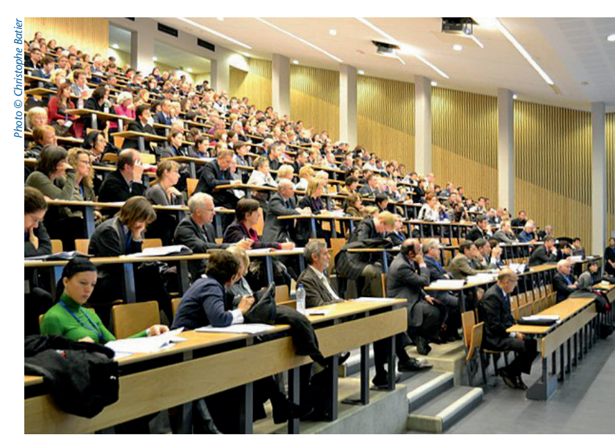
5<sup>th</sup> European Quality Assurance Forum, Lyon, France

at the 5<sup>th</sup> edition of the European Quality Assurance Forum for Higher Education (which EUA organises with the E4 group), which brought together around 450 higher education stakeholders (from approximately 50 countries) to discuss the latest developments and trends in quality assurance.