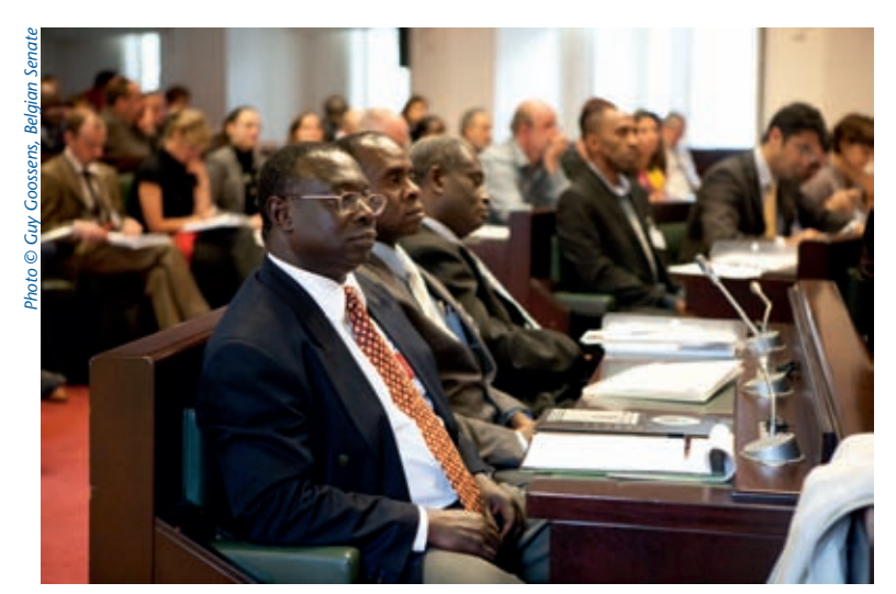
Access to Success Final Dissemination Conference, Brussels, Belgium

Through the "Access to Success" project, EUA has developed a strong working relationship with its sister body, the Association of African Universities (AAU). This also enabled EUA to forge new relationships with African partner organisations and mapped the various ways in which universities contribute to the development agenda. This work has resulted in 2010 in the publication of a 'White Paper': Africa-Europe Higher Education Cooperation for Development: Meeting Regional and Global Challenges, which was tabled at the first official sideevent of the Africa-EU Heads of State Summit focused on higher education. EUA and AAU also put forward a Joint Statement of Europe-Africa higher education cooperation, outlining the commitments of the two organisations. EUA is now working closely with AAU on the follow-up project 'Europe-Africa Quality Connect' (2010-2012) and has developed a partnership with the Southern African Regional Universities Association (SARUA), a partner in a new global project focusing on doctoral education (see Section 2).