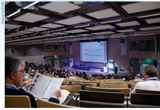
EUA Annual Conference 2014, Universite Libre de Bruxelles (ULB), Belgium

In 2014, learning and teaching in European higher education continued to feature prominently on institutional and policy agendas. EUA's Annual Conference on "Changing Landscapes in Learning and Teaching" provided a platform for intensive and productive discussions on global trends and transformations. Around 350 university leaders and higher education representatives gathered at the Université Libre