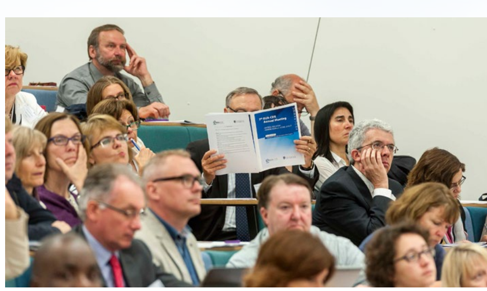
7th EUA-CDE Annual Meeting, University of Liverpool, United Kingdom