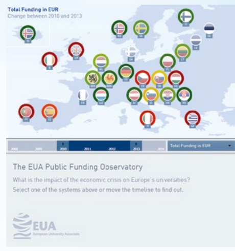
EUA Public Funding Observatory Tool

In October EUA also published the latest edition of its Public Funding Observatory. The Observatory's interactive tool was updated with new data and information, and four new higher education systems – Belgium-Flanders, Finland, Serbia and Slovenia – were included in the analysis for the first time, thus providing an even more comprehensive picture of the development of public funding for higher education in Europe. The published report highlighted a highly diverse situation with regard to public funding in higher education systems, and re-confirmed an increasing