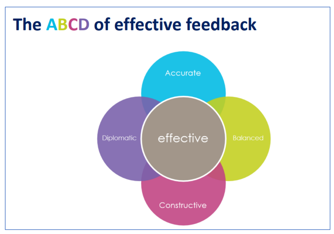
Figure 2: sparqs' ABCD of effective feedback

This support is complemented by a systematic approach to developing course representation systems, including through working with coordinators for course rep training and resources relating to the course rep role for teaching staff (sparqs, n.d.e).