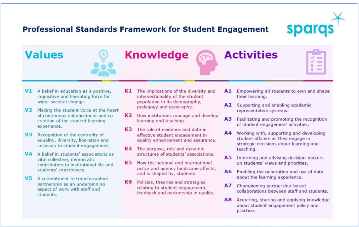
Figure 3: Professional Standards Framework for Student Engagement

Indeed, this framework emanates from a national forum, sparqs' Student Engagement Staff Network (SESN), where staff with operational responsibility for student engagement or academic representation in institutions and students' associations gather under sparqs' facilitation to learn, share and develop as practitioners (sparqs, n.d.g). Gathering a handful of times a year, these meetings impact on individual practice through learning about key sectoral developments, create a space for informing national decision-making, and provide a platform for sharing practice.